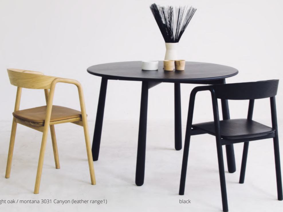
light oak / montana 3031 Canyon (leather range1)