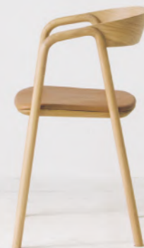
light oak / montana 3031 Canyon (leather range1)