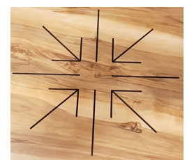
Routed grooves to be used as predrilling holes