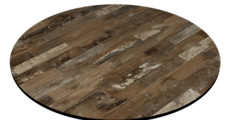
RUSTIC BLOCK WOOD