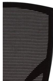
'Soft Feel' Mesh Back