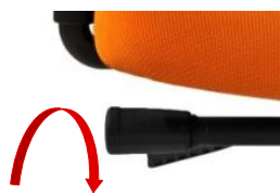
EASY-Adjust Tension Control