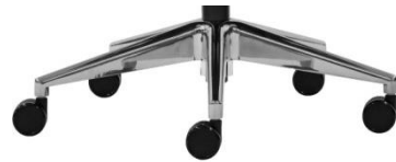
Optional Polished Aluminium Base