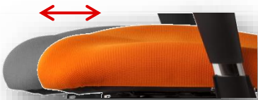
Optional Adjustable Seat Depth