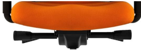
Advanced Dynamic Mechanism with EASY-Adjust Tension Control